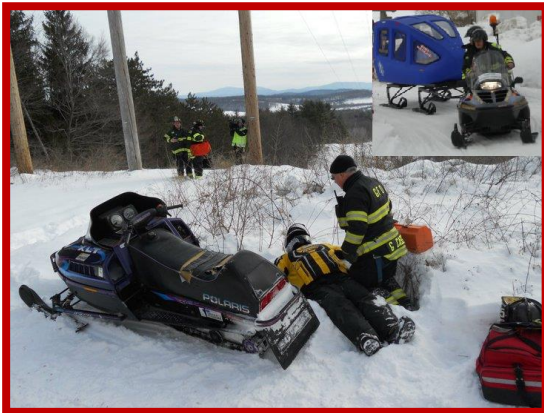
The SnoBlazers perform a mock snowmobile accident rescue drill with help from the Greenwich, Middle Falls and Easton Fire Departments.

"Everything I want is on the trail. Views of the Battenkill and trip to Willard Mountain, Gassing up at Mobil a Hot Chocolate at Dunkin Donuts with Lunch at Green Acres and parts and service at Country Power Products, ParkerMX & Brownell's Sales and Service. What a beautiful place to ride and friendly people/faces everywhere, I love Washington County, Thank You Landowners!"