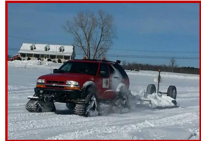
Grooming Lee Porter's, Trail C4A on Route 197 in Argyle

We promote safe, courteous and lawful use of snowmobiles for individual and family recreation while protecting our landowners, improving trails and supporting our community.